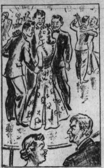
Bessie looks mighty pretty in her cotton evening dress. Ma says she's makin' cotton pickers out of the whole stag line.

YOU ARE CORDIALLY INVITED TO ATTEND The OPENING Of The Charlotte Bus Terminal, Inc. FROM 12:00 NOON TO 10 P. M.