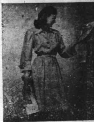
For the tailored look that keeps its femininity, September Good Housekeeping suggests, exaggerated men's cuffs; byronic collar. The pictured dress is lightweight wool, with an easy full skirt, small waist, a soft, bloused shirred top with a roomy pocket. About $30.