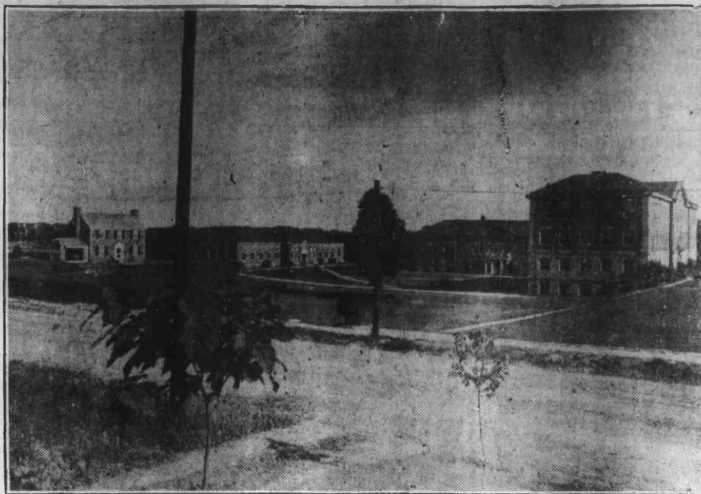
The above campus scenes at North Carolina College shows several of the beautiful build-

ings at the Durham institution. It includes the administration buildings at the left, the dining