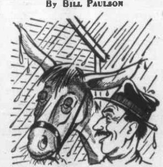
"Socialism is the bureaucrats' rule and like with all rules everywhere all it begets is . . . nothing!"