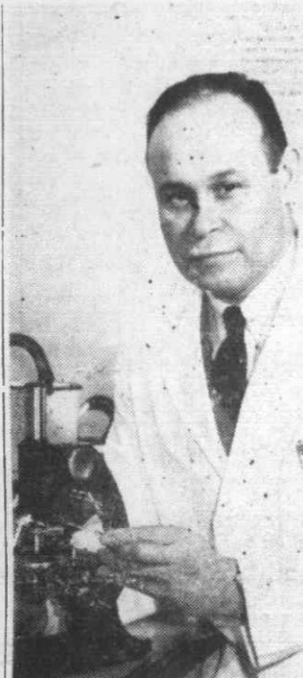
Dr. Charles Drew, noted blood plasma expert, whose untimely death in an auto wreck near Burlington early Saturday morning, rocked the nation. Dr. Drew was enroute to a medical clinic to be held at Tuskegee Institute in Alabama.

Funeral services for the noted physician were held Wednesday at one o'clock at the 19th Street Baptist Church in Washington. Surviving Dr. Drew are his