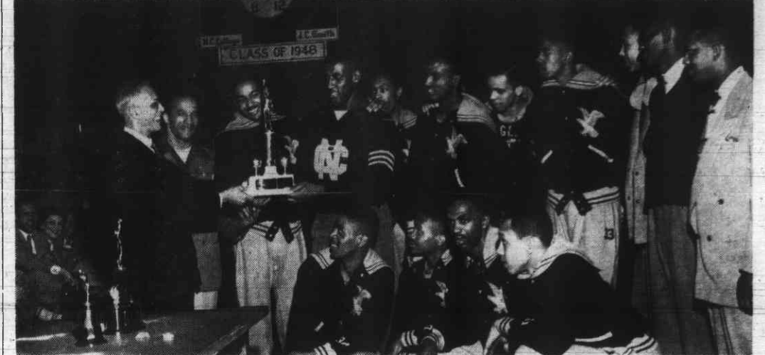
A familiar scene enacted at Fayetteville State College's Lilly gymnasium last Saturday night shows North Carolina College's Eagles receiving championship trophy for the fourth annual Colleges of North Carolina Tournament.