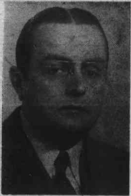
Robert E. Lee