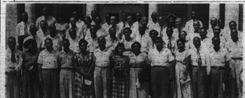
Pictured here are some of the 275 North Carolina principals and supervisors who were invited to attend the third annual conference on "Educational Leadership" sponsored by the North Carolina College