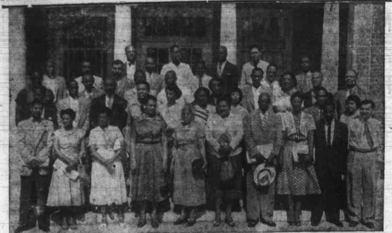
NCC SUMMER SCHOOL TEACHERS—Nearly 1,000 students from many states in the North and Southeast are attending North Carolina College's current nine week term and six week workshop and clinic sessions which are conducted by some 62 full-time teachers. Thirty nine of the teachers that are teaching 140 classes in 18 subjects matter fields are shown.