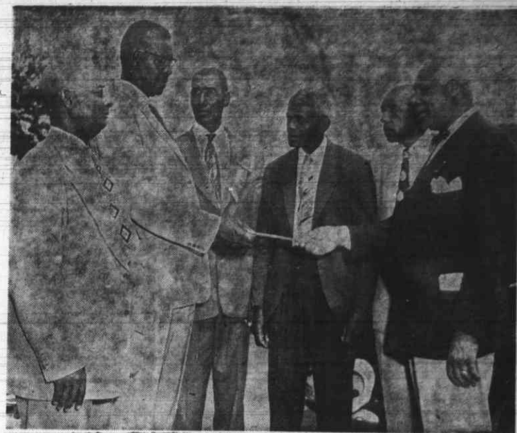
When the Grand Order of Odd Fellows of North Carolina met in Winston-Salem recently, the body made an initial payment of $50 on a life membership for the Grand United Order in the NAACP.