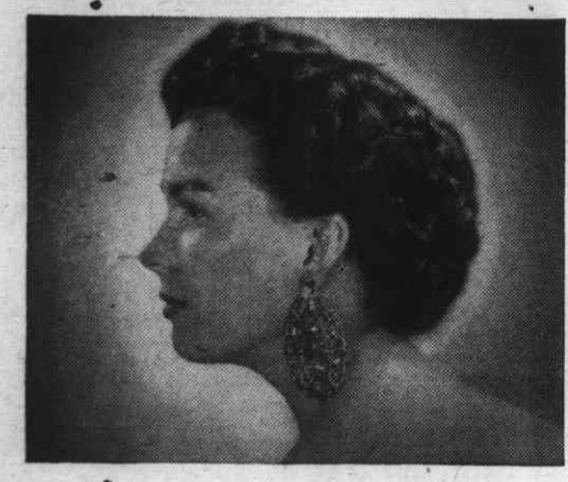
You'll always be his sweetheart

... If you let levely haircolor keep you young and beautiful