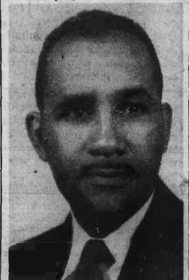
CLARENCE L. MITCHELL

Clarence Mitchell, Director, Washington Bureau of the NAACP, joined the staff as labor Secretary in 1946. His first duty with the organization be-