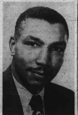
ROBERT L. CARTER

Mrs. Daisy E. Lampkin of Pittsburgh, Pennsylvania, has served as Field Secretary of