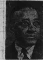
"The Lord of host is with us..." Psal. 46:11.

It is a great thought for man to have the blessed assurance that he does not walk this way alone. Loneliness has brought many down to despair and defeat. It is hurtful for a human being to lose his sense of belonging—to feel unwanted, isolated and cut off. What is more crushing and devastating to the human spirit than this feeling? Nothing! We all need the heart-warming feeling of a sense of human and Divine communion. The text expresses this sweet assurance for the Holy writer. He rejoices in the fact of Divine fellowship and communion. He had the deep spiritual satisfaction of those who walk with God. He claims Divine companionship—"The Lord of hosts is with us."