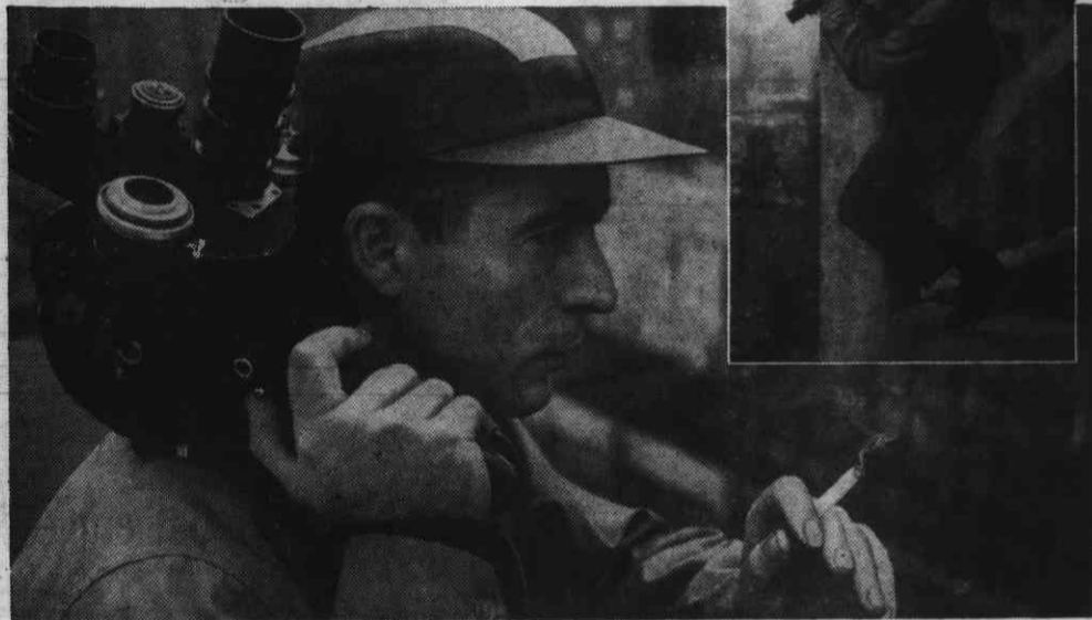
B. J. Reynolds Tobacco Co., Winston-Salem, N. C.