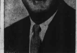
Harry A. Stuhldreher, a member of Knute Rockne's famous "Four Horsemen" and an All-American quarterback on the undefeated Notre Dame squad of 1924, will be a midwinter convocation speaker at Jackson State College Thursday, Feb. 21. An Assistant to the Vice-President of United States Steel Corporation, Mr. Stuhldreher was born and raised in Massillon, Ohio.