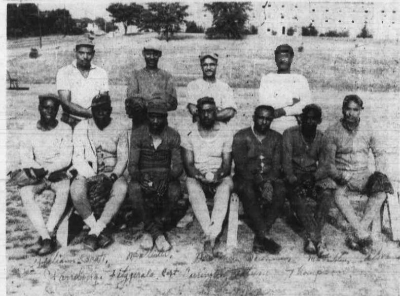
Pictured here are members of Zafa Temple Shriners "long underwear" baseball team. The Durham Shriners will oppose a team from Kindah Temple of Fayetteville in the annual "long underwear" battle at Durham Athletic Park Saturday night.

Next week, another team in the League will be featured on this page.