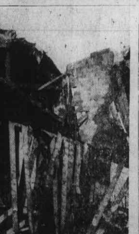
Comeback story of the year is church on Third street. Before picture (inset) shows church seen in these before and after picture shows ruins left by fire in April, 1957. After pictures of St. John's Baptist moved back in early last May.