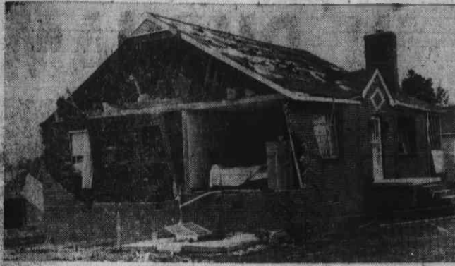
The weather made much of the news last year. Scenes at top show damage left by Tornado which skipped into southern area of suburbs last Spring.