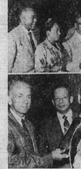
Unprecedented in city's history was joint conventions of National Bankers Association and National Business League, N. C. division, here. The convention also provided setting for one of few speeches delivered before Negro Governor Luther Hodges, shown in top center panel.