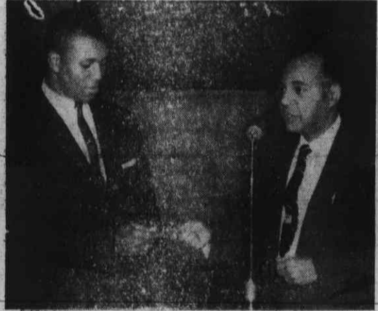
Wes Covington of the Milwaukee Braves won World Series. He's shown getting one of several presentations in Durham last winter after his hero's reception.