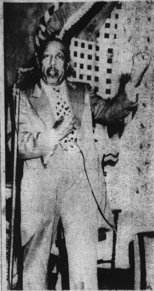
CHARACTERISTIC POSE—This picture taken of the late Bishop C. M. (Sweet Daddy) Grace depicts him in a characteristic pose. He is pictured here in frock tail coat and wearing lung tresses, which he often curled.