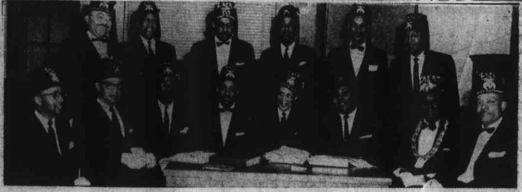
Host To Annual Gala Day Celebration

Zafa Temple No. 176 of the Ancient, Egyptian, Arabic Order Nobles Mystic Shrine, will be host to the Annual Gala Day gelebration for the Desert of North Carolina May 13 and 14. In a recent meeting of the plan-ning committee for the Desert of North Carolina, Durham was