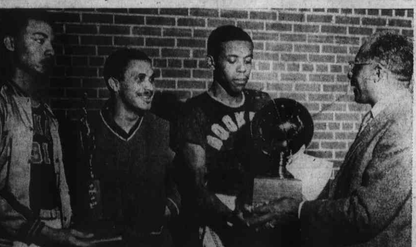
THE CHAMPS - When the Booker Washington High School, Rocky Mount last weekend won he 3-A State High School Basketball championship in the tour-

bers before an applicant can be considered for membership. The star and eggs, $6.50 and grilled cheese sandwich, $3.