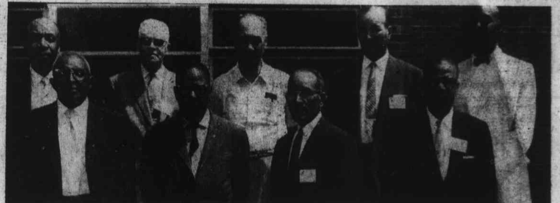
PAST PRESIDENTS — Pictured here are members of the Past Presidents Council of the North Carolina Funeral Directors and Morticians Association of North