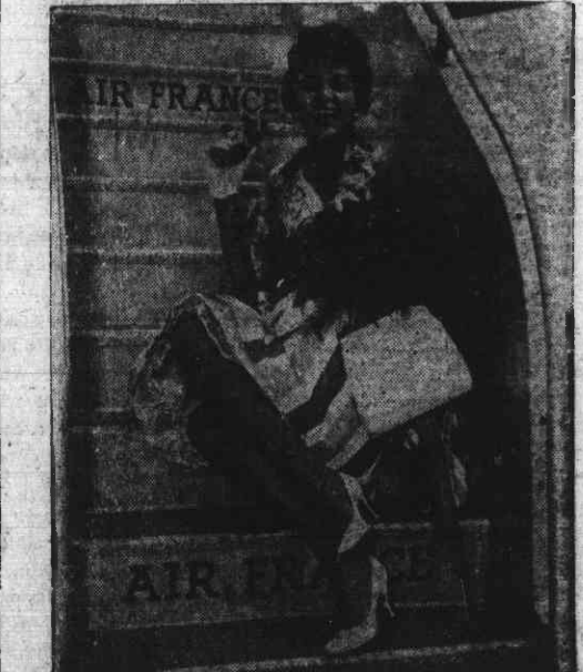
"MISS FESTIVAL" AT DELTA SHOW—Vivacious LeJeune Hundley, holder of the most beautiful girl in the world by the 1960 International Film Festival at Cannes, France, will be one of five models to appear in a fashion show luncheon sponsored by Delta Sigma Theta Sorority, during its 26th National Convention at Chicago's Palmer House Hotel August 14-21.

The boy's body was not recovered until nightfall, more than two hours after the drowning. It was brought up after dragging operations by the Claremont rescue team.