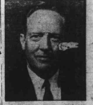
TO RECEIVE ELKS' LOVEJOY AWARD—U. S. Attorney General William P. Rogers will be honored on August 22, at the Elks National Convention in Chicago when he is presented the Lovejoy Award, for his contribution in the field of Civil Rights.

GREENSBORO — Richard M. Nixon, Republican candidate for the presidency told a gathering of some 40 newsmen Wednesday night he would not change his position on civil rights for political expediency. "My position in the South is the same as it is in the North, East and West," he told a televised press conference. "Everybody is aware of my strong convictions in this matter." In the address later in the evening, he told the coliseum crowd estimated at 14,000 of the need for extending human rights to all segments of the population. Among the crowd which filled the coliseum was an estimated 500 Negroes who took part in the un-