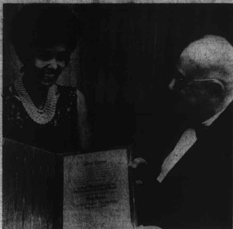
LADY OF THE HOUR—Lena Horne receives her citation from NAACP President Arthur B. Spingarn, right, as Roy Wilkins looks on. Miss Horne was honored along with Oscar Hammerstein, II, in memoriam, at the NAACP's Fourth Annual Freedom Fund Dinner in New York City this week. A total of 1,030 attended.

NEW ORLEANS, La.—Segregationists, deprived of their legal support by federal court rulings here this week, appeared to be leaning toward establishment of quasi-private schools in an effort to maintain racially segregated schools. Best opinion in this southern metropolis felt that the Louisiana legislature would now resort to closing of the schools or of paying tuition grants to students to attend private, segregated schools. This was regarded as the only step open since the legislature had seen fall in one day its entire framework for interposing state authority before the federal courts to keep segregation. Shortly after the 5th U. S. See LOUISIANA, 6-A