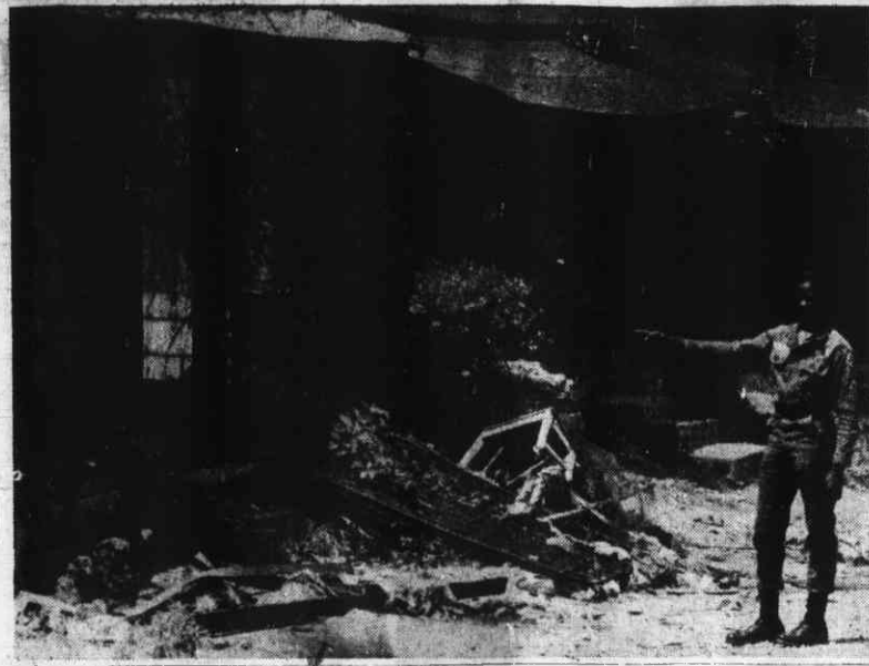
FIRE RUINS LEFT IN THE STREET — This unidentified soldier, a resident of the Poplar Street area, points in disgust to fire ruins of this dwelling left after firemen extinguished a blaze at this Poplar street residence. The ruins, consisting of bedding and other interior furniture, were pulled out of the house several weeks ago at the time of the fire and have remained to clutter up the street in front of the dwelling, adding to the general eyesore created by the area. Although residents of the area know that eventually the entire section will be cleaned up by Urban renewal programs now underway, they feel that somebody on a high level in city government has let them down by failing to have the debris carted away. The debris had not been removed as of late Wednesday.

WASHINGTON, D. C. — President John F. Kennedy approved a "peaceful assembly" in Washington at his press conference Wednesday and hit those who express alarm over demonstrations but "never talk about the problem of redressing grievances." The President explained that the manner in which the proposed August 28 "March on Washington" has developed shows "every evidence that it is going to be peaceful." President Kennedy also ended all speculation about whether he would remain in Washington or leave the city, stating: "I look forward to being here. I am sure members of Congress will be here. We want citizens to come to Washington if they feel that they are not having their rights expressed." The President made it clear, however, that he was squarely against demonstrations which lead to violence and in such situations he said: "I think the cause of advancing equal opportunities only loses."