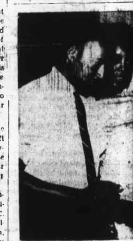
COUPLES LEARN TOGETHER — Three husband and wife teams enrolled in the North Carolina College audio-visual workshop

Junior will do well to see that Junior has shirts that have the big-boy stripes and checks and plaids — even the same sort of button-down collar, or short "spread" that the teen-ager wears. And he will want his suits and sport coats to have the simple yet masculine traditional, natural-shoulder lines that sophisticated grown-ups are wearing.