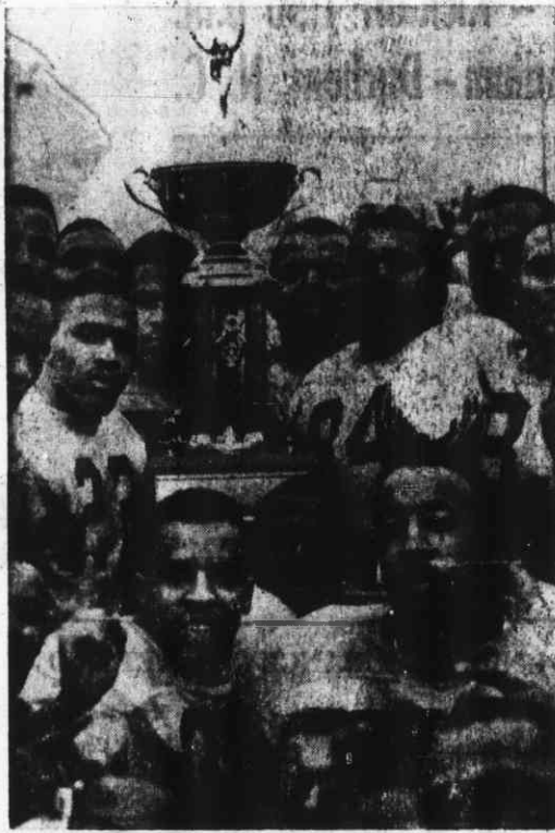
North Carolina College Eagles good sportsmanship between the CIAA CHAMPIONS — These schools in the arch rivalry. The trophy they earned for keeps after defeating the A. and T. College Aggies 6-0 for the CIAA championship on Thanksgiving Day. The three-foot trophy was Greensboro Coca Cola bottling donated by the Durham and companies in 1960 to promote