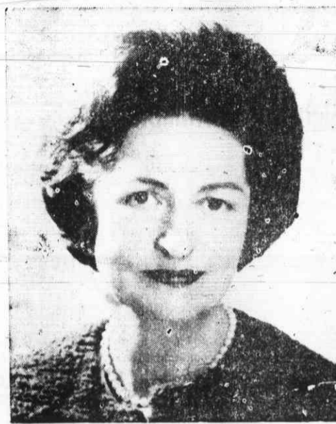
MRS. LYNDON B. JOHNSON