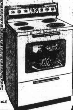
Model RB 336-E

FREE $50 Gift Certificate Only During Value Days! Ask About It! No Obligation! Drawing Dec. 23