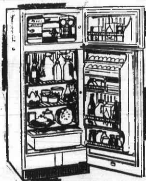
HOTPOINT MODEL CTA 312E