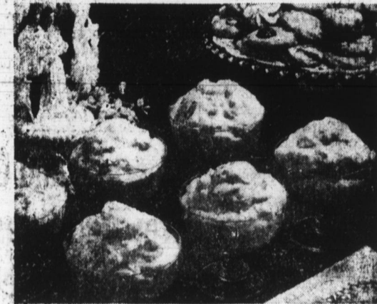
STRAWBERRY RICE CHIFFON (Makes 8 servings)

It's June—and the bride is a Very Important Person! Honor your favorite bride-to-be at an extra-special shower. Serve delightful Strawberry Rice Chiffon. Whipped Carnation Evaporated Milk enhances the delicate strawberry flavor—without the heaviness of fat. Do serve it soon!