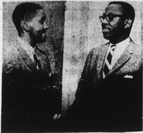
Congratulations In Order