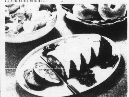
VEGETABLE STUFFED BEEF ROLL (Makes 6 to 8 servings)

Please your family! Serve tasty but inexpensive Vegetable Stuffed Beef Roll. The roll will be moist and delicious because it's made with Velvetized Carnation Evaporated Milk. Carnation helps make your cooking faster, easier and better. See for yourself—try Carnation soon!