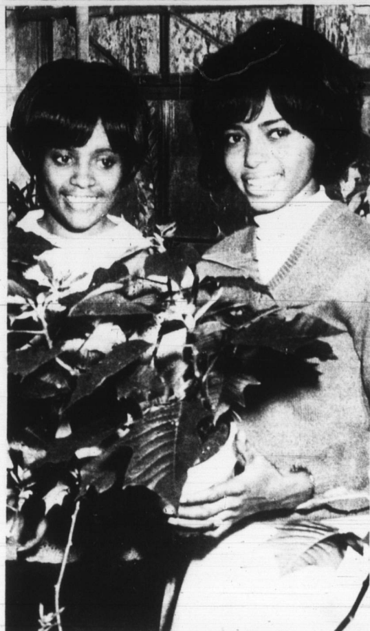
CHRISTMAS BLOSSOMS —A. blossomed shortly before students began their holidays. The poinsettias were produced by the A. and T. College Department of Floriculture, a part of a bumper crop which