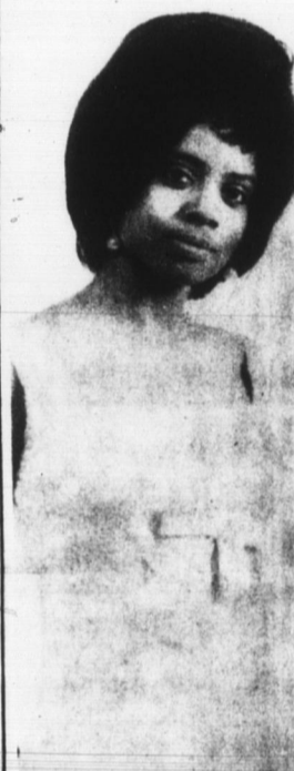
IN CITY FOR CHRISTMAS —Fontella Bass, will be one of the hit line stars in Durham for the Christmas holiday celebration. With her fast growing hit of "Rescue Me," Fontella is one of the top growing female vocalists in the rock and roll field. The Christmas show, which will be divided into two parts, will include Johnny Thunder, Billy Stewart and Sugar Pie DeSanto. The first show will be held at the Civic Center and the second part will be at the Stallion Club.

The Rams shot 57.5 per cent in the first half (23 of 40) while the Eagles hit for only 41.2 per cent (14-34). The Eagles did better in the second half, making 56.1 per cent (23 of 41) while the Rams hit 53.8 per cent (21 of 39).