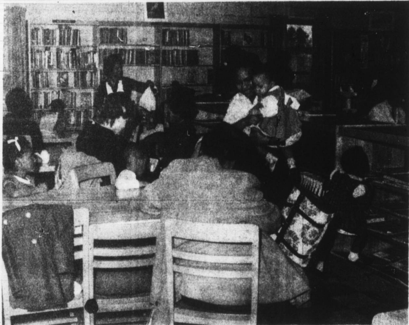
CHILD HEALTH CLINIC OPENS —The new child health supervisory clinic opened for the first time last Wednesday afternoon in the Lakeview branch of the Stanford L. Warren Library on Dearborn Drive. The new monthly clinic offers a variety of services to preschool age children, and is designed to serve the northern part of the county, sparing residents there, trips into town for such services.