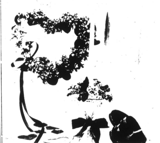
HOW TO MAKE VALENTINE DECORATIONS

E. MAIN at ELIZABETH ST., TEL. 684-0521, OPEN 'TIL 9 P.M.