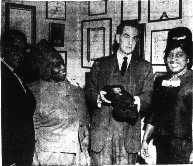
SENATOR NAMED LIFE MEMBER —Senator Clifford P. Case, R-N.J., was named a Life Member of the National Association of Colored Women's Clubs during recent ceremonies held in his Washington, D. C., offices. Seen third from left, the Senator holds plaque awarded to him as "New Jersey Citizen of the Year" by the Northeastern Federation of Women's Clubs. Posing with the honoree, from