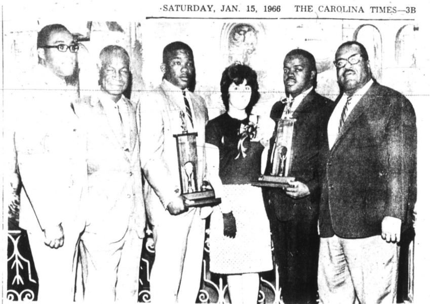
DURING THE FESTIVITIES of the 33rd Orange Blossom Classic in Miami, Fla. recently, the F. W. Woolworth Company sponsored the Annual Coaches and Players breakfast for the two participating football teams. Trophies were awarded to the individual on both teams