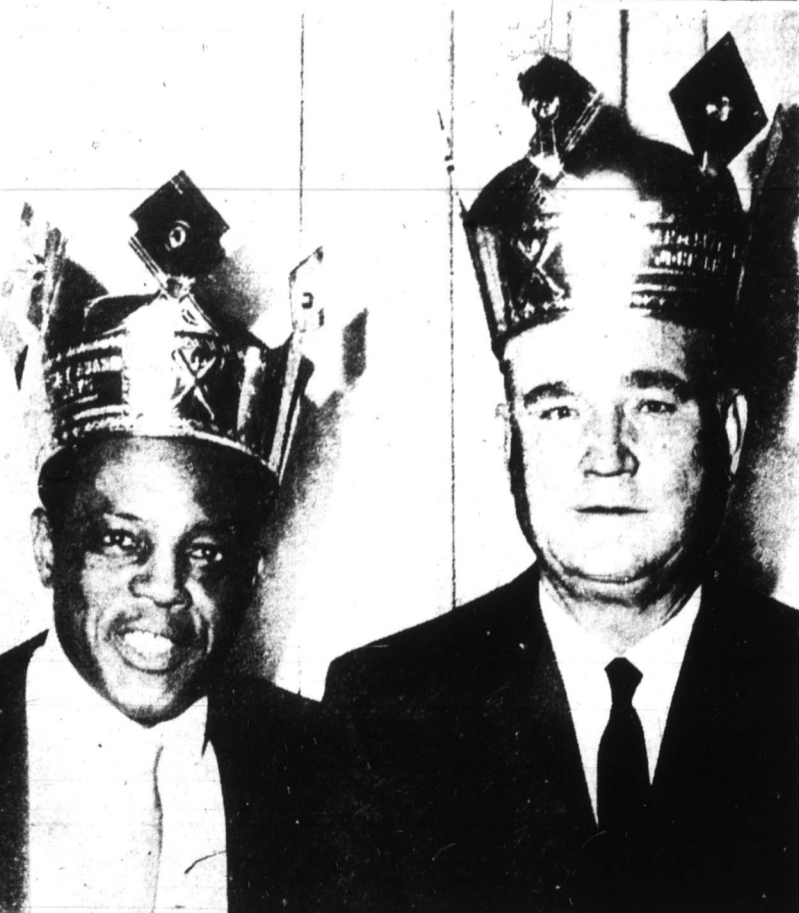
WILLIE MAYS , the majors' home-run king of '65, wears the Sultan of Swat crown, presented at the Baltimore Tops in Sports dinner, while Johnny Mize, former homer king, sports the retroactive tiara. Mize led the N. L. in homers in 1939 and '40, and tied in '47-48.