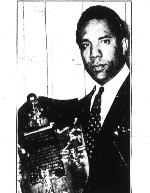
ZOILO VERSALLES , Twin shortstop, and the plaque awarded him as the American League's Most Valuable Player in '65.