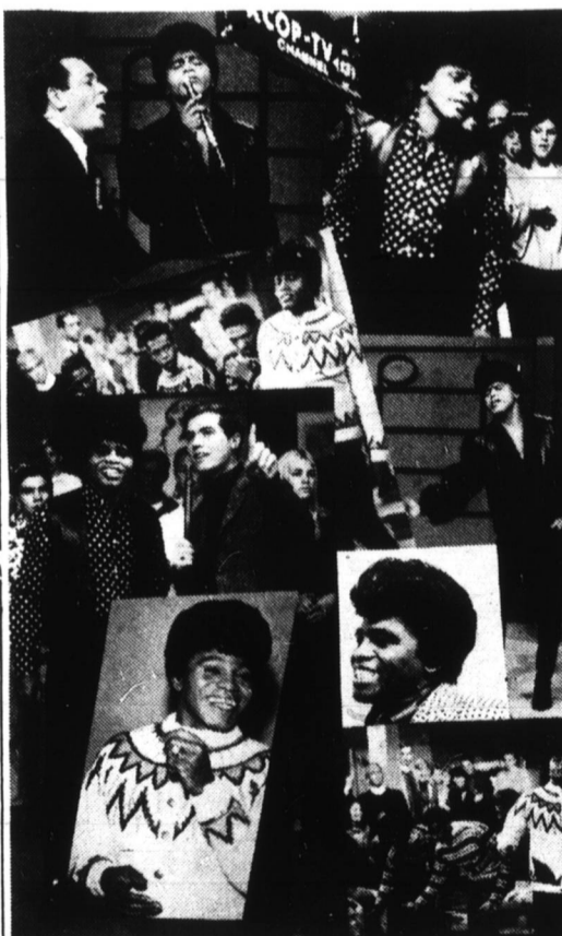
"MR. DYNAMITE" IN HOLLYWOOD! —On a recent trip here to discuss a movie of his fabulous career, super-entertainer James Brown guested on numerous national TV shows singing his latest million-seller, "I Got You." He also played to a packed L.A. Sports Arena where he previewed his next recording, "Ain't That A Groove."