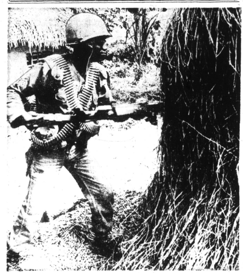
In South Viet Nam, a member of the U. S. 9th Cavalry takes no chances while on patrol in the Hue area. There could be a Viet Cong guerrilla in the haysfack. case, he uses his bayonet.