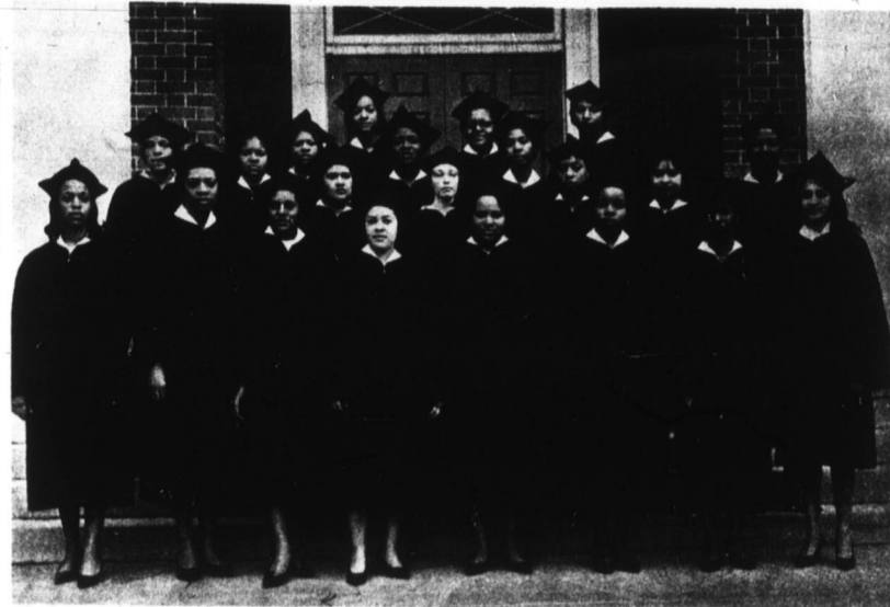
PROSPECTIVE GRADS —Some of the North Carolina seniors at Bennett College who are scheduled to receive degrees at commencement exercises on June 6 at the Greensboro institution.