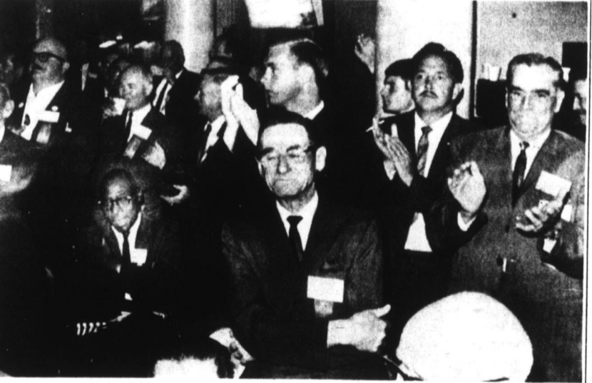
GEORGIA DEMOCRATIC CONVENTION—(Macon, Ga.)—Georgia Democrats give a standing ovation to the state's Democratic gubernatorial candidate, segregationist Lester Maddox. Abstemious from the applause is one Negro delegate at left. During the Georgia Democratic convention delegates named Maddox as head of the state Democratic Party.