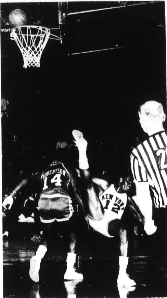
TALENTED TOE? —(New York) —In a display of dazzling footwork, New York Knickerbockers' Dick Barnett appears to be kicking the ball right into the basket during game with the Cincinnati Royals here Nov. 22nd. Barnett tries to keep