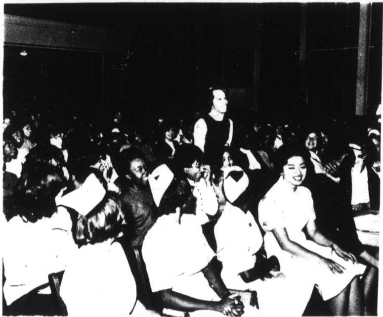
"ARE MEN ALLOWED IN NURSING?" — This question "broke up" an audience of five hundred students at Girls High School in Boston, Mass., at a lively nurse recruitment seminar sponsored by Boston University's ODWIN (Open Doors Wider in Nursing) program.

To help reduce the nationwide shortage of 125,000 nurses, the program was aimed at interesting Negro high school girls in nursing as a career and was highlighted by a Nurses Fashion Show. Girls in the foreground are student nurses who