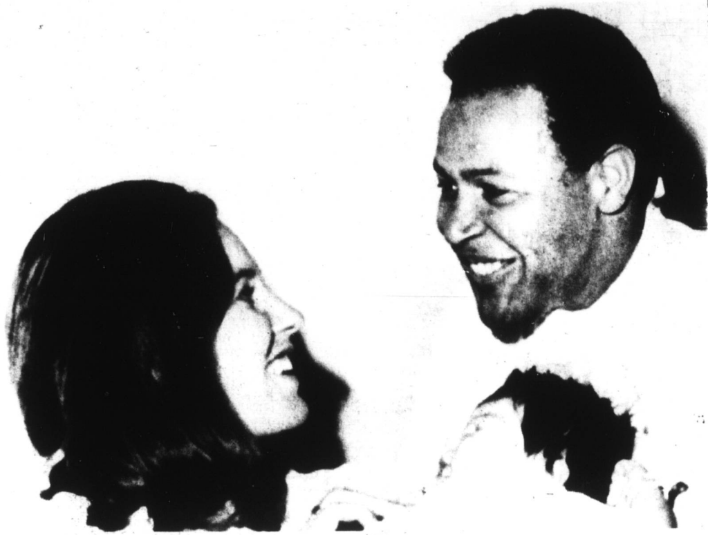
LITTLE MISS "TWIST"—(Philadelphus)—Rock 'n' Roll singer Chubby Checker and his wife Sharina, the former Miss World in 1963 and Miss Hol-