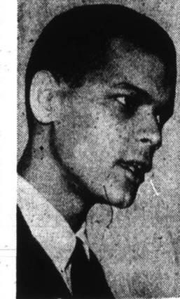
"I intend to sit here for the bowed and cocked to one side, was given the oath of office

rest of the session.' Rep. Bond, his head slight-