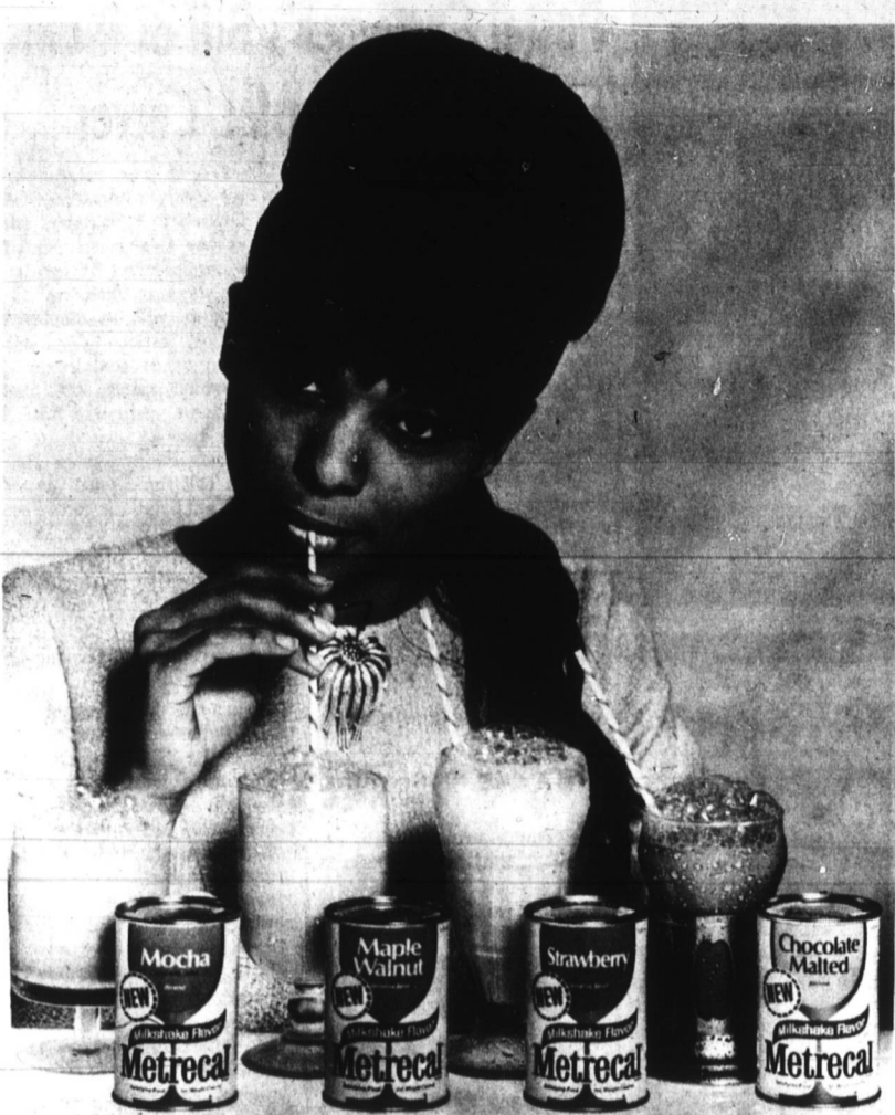
WEIGHT WATCHER OR GIRL WATCHER? Recent surveys reveal that

This is how it works: A preschooler fitted with ear phones listens as a tape recorded voice asks him to point out one or another of the 12 pictures of familiar objects in front of him. The instructions are given at various sound levels, including that of normal speech. Failure to hear a certain number of words at the lower-decibel range is an indication of possible hearing loss. The roar of a lion, a low-decibel sound, and the chirp of a bird, a high-decibel sound, are also included in the test.