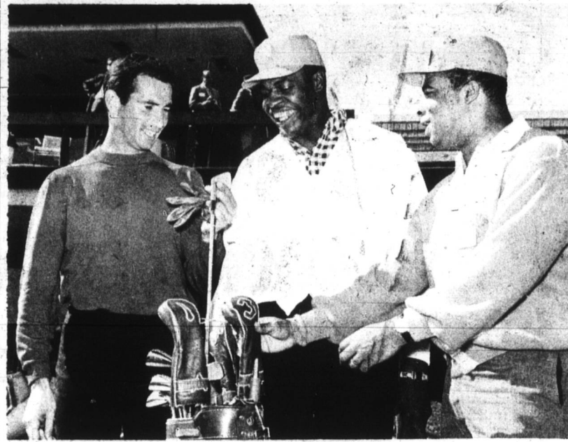
NORTH CAROLINIAN AT THE ASTROJET CLASSIC —Former L. A. Dodger Pitcher, Sandy Koufax and Lamar Lundy, L. A. Rams, inspect North Caro-