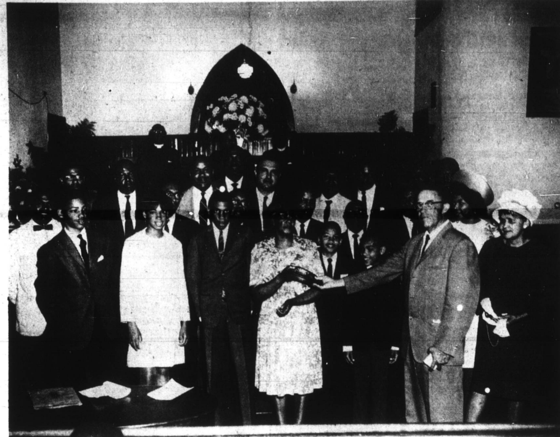
20-YEAR SERVICE PLAQUE IS PRESENTED

2B-THE CAROLINA TIMES SATURDAY, APRIL 15, 1967