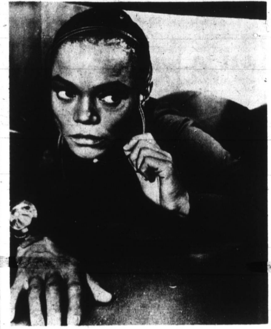
LADY SPY — Ertha Kitt is caught in a scene from "Mission Impossible" segment titled "The Traitor." Miss Kitt recently started a free dance class in Watts, Calif.