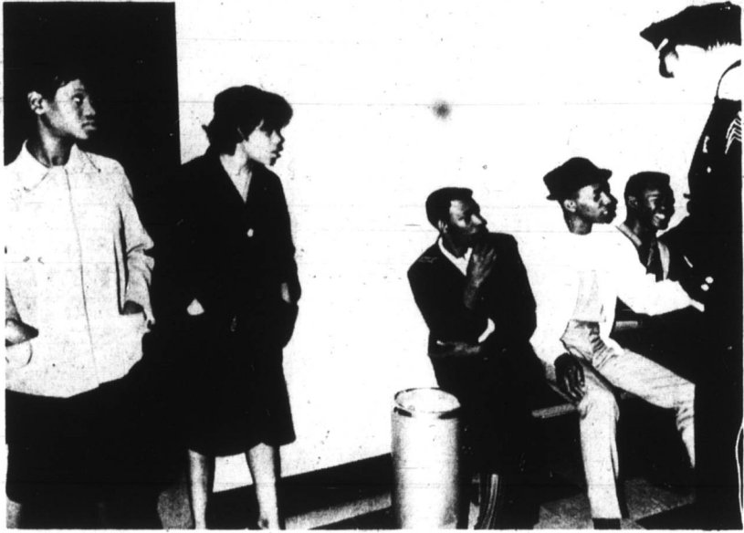
YOUTHS QUESTIONED — one person was killed and eight were injured in a shooting spree on Chicago's west side. Police say an unidentified victim was found dead in a truck. Police are holding one youth in custody in connection with the shooting and searching for 3 other persons allegedly involved.