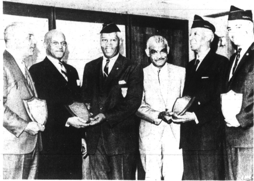
MARSHALING OF MARSHALS — In preparation for 369th Veterans' Association Memorial Day Parade on May 28 in New York City. A Philip Randolph (second from right), president of the Brotherhood of Sleeping Car Porters and member of the AFL-CIO executive council, was installed as this year's grand marshal. At the same

Huge quantities of potassium chloride and other chemicals are being taken from the Dead Sea in an indirect way has become an important life-giving source.