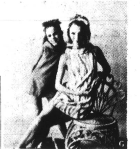
#8776 for girls sizes 7-14.

The London-born mini-dress is swarming over American shores. One "mini" that could establish a beachhead all by itself is McCall's simple A-shape, featured in Pattern #8744 for misses, and